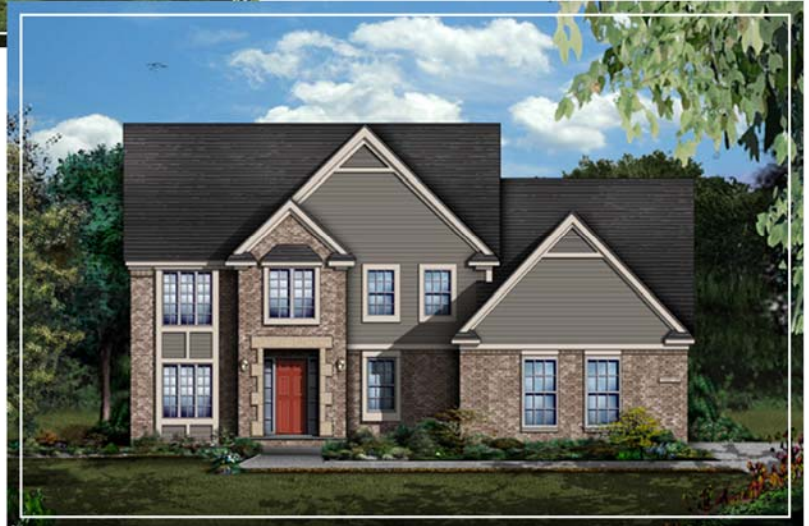
Optional front door stone surround - Elevation E

All information contained herein was accurate at the time of publication. Price, plans, specifications, color and materials are subject to change without notice or obligation. Artwork is conceptual and may vary in construction.